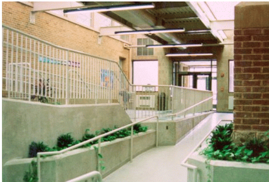
Addition to Central Primary School, Interior

Initial investigations concluded that the layout of the building did not lend itself to installation of an elevator to connect the floor levels. Instead, a new main entry atrium space was created by enclosing an L-shaped exterior courtyard. The various floor levels were connected with a series of stairs and ramps within this space. Translucent skylight panels and glass block walls bring natural light into the space.