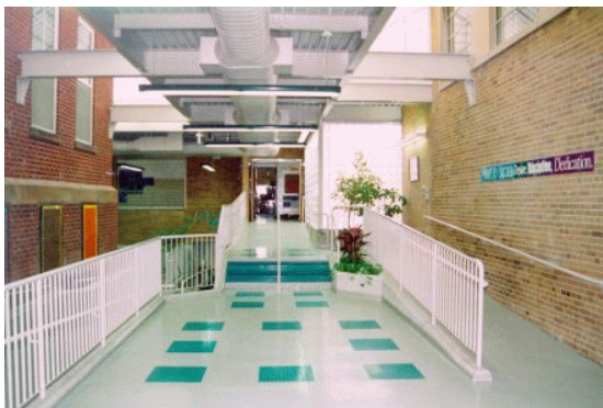
Addition to Central Primary School, Interior